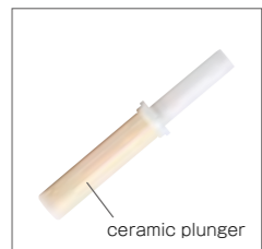
Non corrosive ceramic used in the plunger. ( 100μL - 10000μL )