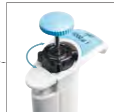
New material used for 4 notch-lock improves its strength, which minimizes the lever shift from the original position.