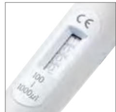
Enlarged and easy to read counter display for volume setting.