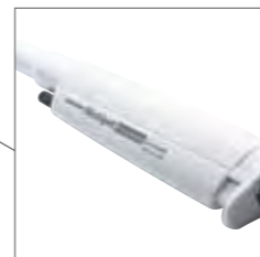
Materials used for pipette body have high tolerance to solvents and drop impact.