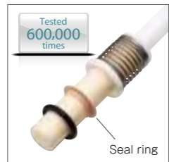
Seal ring for the Premium is tested dispensing / aspirating 600,000 times. Non-greased plunger makes it easy to maintain. ( 2μL - 1000μL ) The test was conducted by Nichiryo. The test result may vary with condition of usage.